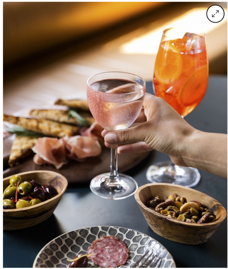
Aperitivo hour at Moby's.