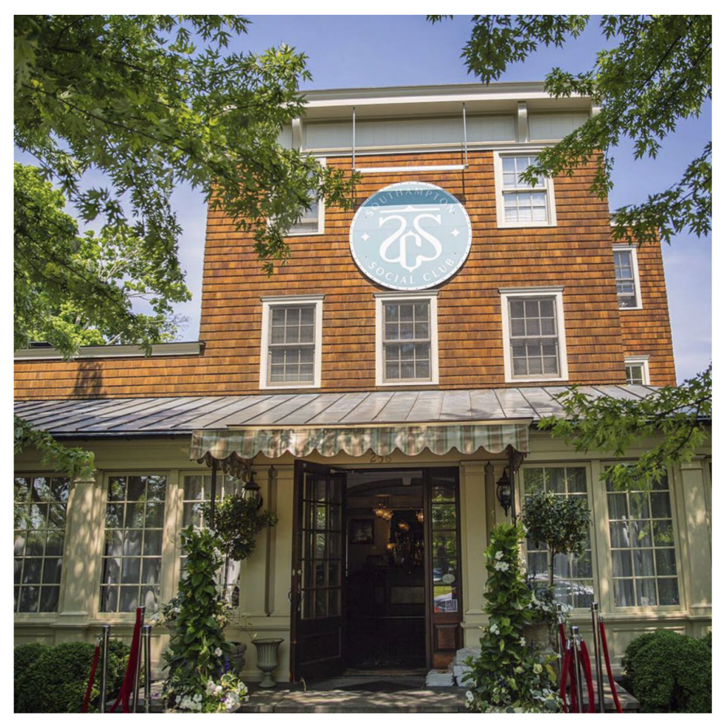
Southampton Social Club is revamping the cabanas and the drinks list.