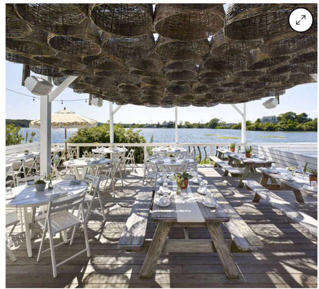
Montauk's waterside Surf Lodge.