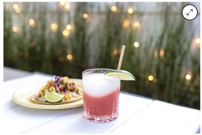
Frozen strawberry margaritas at Rita Cantina.