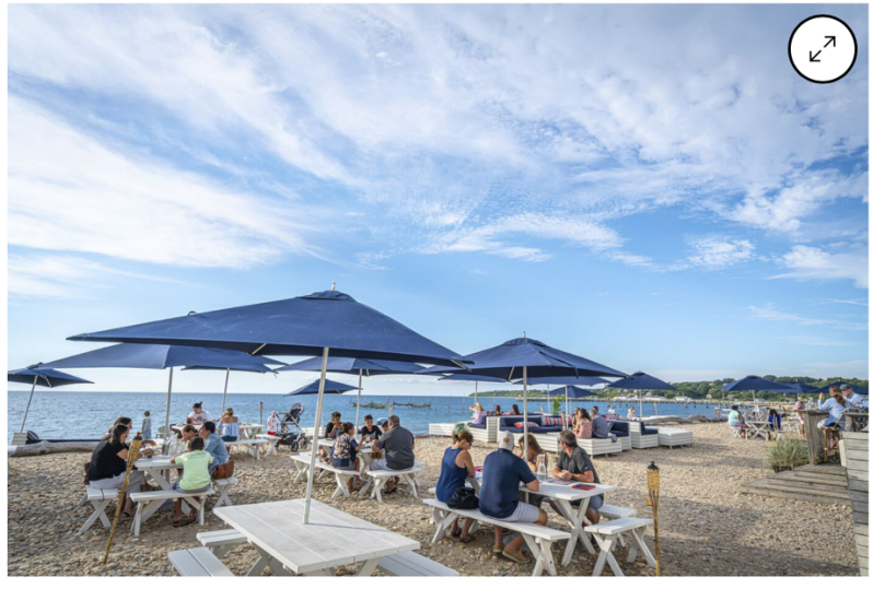
Live music will return to Montauk's Navy Beach this summer.

Bottle service is (mostly) gone; this season's top spots are familiar ones with sparkling new drinks and spaces.