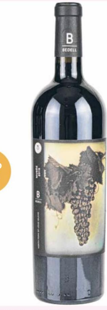
BEDELL CELLARS MUSÉE 2019